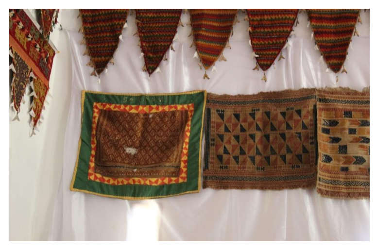
Research Collections Photo, 2017. The Tappan cloth for pedestal or lid

Below is the remain of a tool to weave tappan cloth, which is not complete anymore as there are no more people weaving this cloth.