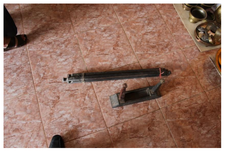
Tools for weaving tappan cloth (trays) found at the Sanggi Unggak Museum

Below is the remain of a tool to weave tappan cloth, which is not complete anymore as there are no more people weaving this cloth.