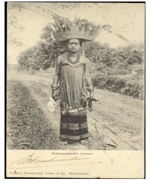
Figure 2. Lampung Pepadun's Bride Clothing

Source: KITLV httpwww.kaskus.usshowthread.phpt=10304964 Vrouw uit de Lampongse districten in traditionele klederdracht year 1915