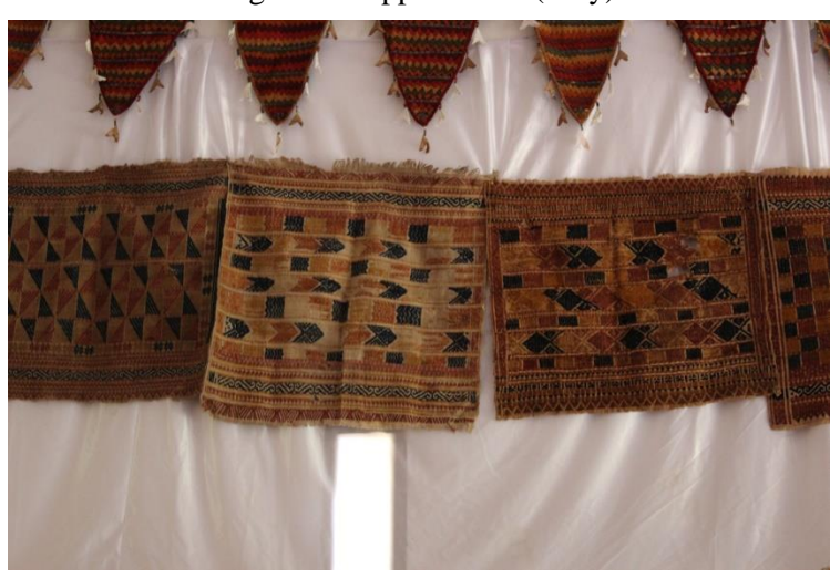
Figure 3. Tappan Cloth (Tray)

It is named Tappan cloth due to its function which is for the base of a food place, or a cloth for food cover or for delivery at a wedding or other traditional ritual event. It is a small rectangular cloth with various motifs. The oldest motifs found are the shape of a ship, puppets or leave. The fabrics are woven with natural colored threads such as white, brown, or black, and beige. The colors are available in nature, because the coloring is based on the plants formulated into colors. For example, yellow is taken from turmeric, and red is taken from roses. The shape of the motif is also diverse, usually in accordance with the forms of the surrounding nature. Like the picture below: