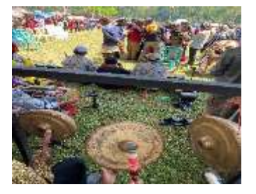
Figur 3. Music or Karawitan Source. (It was created by the researcher, 2024)