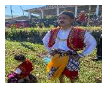
Figure 4. Costumes and Make-up