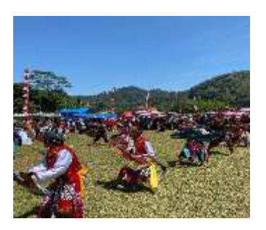
Figure 6. Value and Meaning of Symbols Source. (It was created by the researcher, 2024)