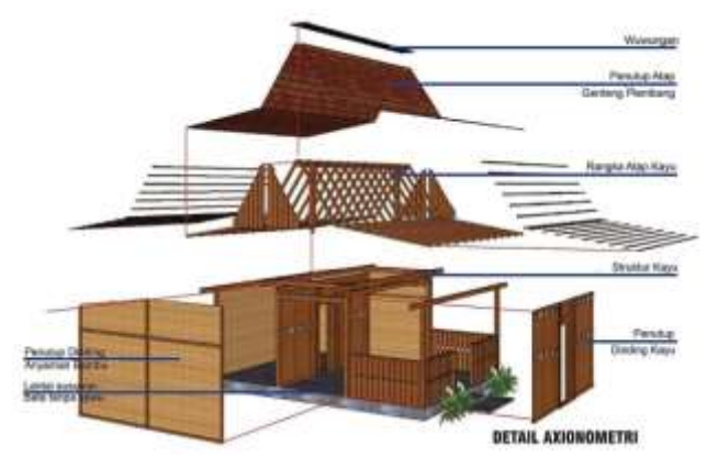
Figure 4. Material structure of the Osing traditional house (Source: Perbup Banyuwangi No.11 of 2019, about Osing architecture)

Modernization is not something foreign or new, but modernization is something that continues throughout life, because science and technology continue to develop and give birth to new mindsets and innovations. When discussing an architecture based on the most important figure in a building, of course, it will not be separated from the building structure, as in Figure 4.