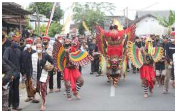
Figure 1. The procession of the ider bumi ritual around Kemiren village

A series of traditional activities cannot escape a traditional ritual that is still being carried out including: among-among, selapanan, kirim dungo, mudun lemah, bakalan, sepasaran, surup, bangkat war, tublek punjen, surtanah, telung dina, pitung dina, petangpuluh, satusan, taune, sewu, rabu wekasan, 1 suro, ider bumi, bersih desa, mepe kasur, seblang, kebo-keboan, pethik laut, janger art, rengganis, angklung caruk, kuntulan, jaranan and gandrung. Spiritual value; every time they hold a special event such as a tradition or traditional ceremony, the Osing tribe believes in the existence of danyang or spirits guarding the village (Indiarti, 2015). Although the majority of the population is Muslim, they uphold the value of tradition wrapped in ancestral cultural heritage (Blambangan). As shown in Figure 1, Ider bumi is a ritual held by Kemiren residents believed to be aimed at warding off bad luck and a form of gratitude for the abundant crops. In other villages such as Olehsari, Seblang is a special ritual that is sacred and passed down as an annual routine procession. Seblang dancers dance unconsciously, it is said that the ancestral spirits that possess them are believed to bring sustenance and be kept away from disease outbreaks, as shown in Figure 2.