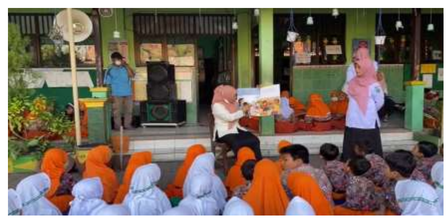
Figure 2. Activities to Develop the Implementation of SLEEK (Reading a local membacakan cerita daerah)