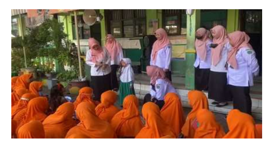
Figure 3. Telling a story using Folklore

The literacy activities do not only focus on the purpose of reading. Cultural literacy activities above can give the opportunity for students to explain the culture or local wisdom values that have developed such as regional songs, folklore and traditions. This is done so that each student is able to adapt to their culture and get to know new cultures without leaving their culture. This is in line with Molinsky's (2013) statement. The most recently developed concept is that of global dexterity, which is the capacity to adapt one's behavior to different cultures, to fit into a new culture without giving up one's own personality.