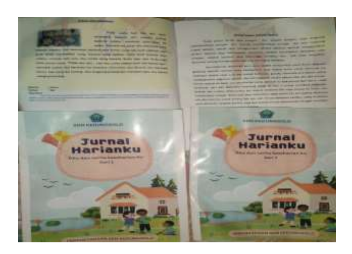
Figure 4. Daily Journal Stories of Student's Work On SLEEK Activities

The reading source for this SLEEK activity utilizes fiction books in the school library. The teacher also wrote a short article about regional origin stories and local culture. This is done so that students know and understand local culture and are able to understand the morals that develop in society in order to shape character and behavior in everyday life. Literacy activities provide many benefits in the long term, as a basis for children's habit of reading. Literacy can have a lasting beneficial effect if properly implemented. Literacy develops over time in a child's life, and parents play a crucial part in a child's literacy development. (Buvaneswari, 2017).