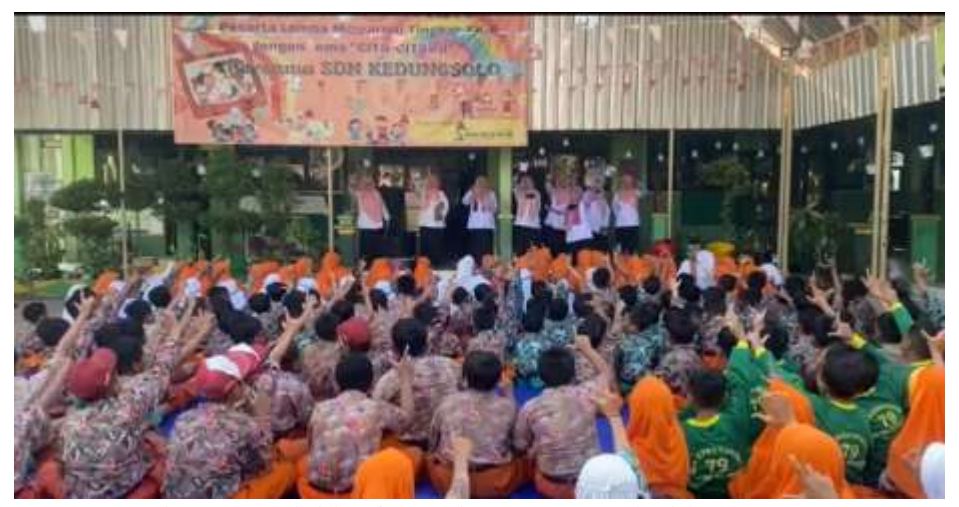
Figure 1 Activities for getting accustomed with SLEEK

At the reading habitual stage, based on the concept, there are several acts need to be done by the stakeholders, including the teachers, such as 1) Reading a book or directing students to read a story/enrichment book for 15 minutes before the lesson starts. Students can do this activity in the reading corner in each class. This activity can be done either aloud or silent reading, 2) Providing a collection of non-learning books to support the 15 minute reading activity, 3) Encouraging literacy habits by ensuring the school facilities and infrastructure functioned properly so that they can be used to foster students' interest in reading, 4) Collaborating with other external agencies to add more book collections, develop reading book facilities, etc. 5) Be selective in selecting book collections which are appropriate to the students' ages.