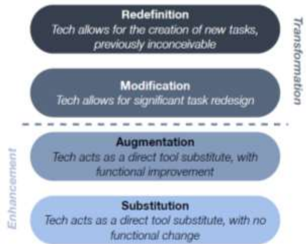
Figure 2. The SAMR Model by Puentedura (2006, 2014, 2020)

Along with the development of ICT, the government laws and regulations as well as the PPG program purposes, however, it is found that the subjects which specifically teaches the technological knowledge for teaching English, named “New Technologies in Teaching and Learning”, is a selective subjects. However, that subjects is one of the selective subjects chosen by the PPG students. These selective subjects are chosen from a range of options provided by the LPTK which holds the PPG Program. The list of selective subjects offered is predetermined at a national level. It should be noted that not all LPTKs offer the course on New Technologies in Teaching and Learning, which means that not every PPG student has the opportunity to choose this subject.