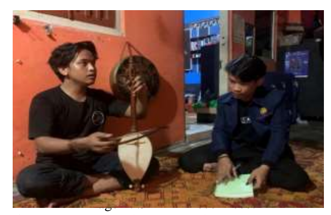
Documentation: From (Muh. Al Furgan)/Iphone Xr Date 4 December 2022

"Before Sinrilik was called a performance in contemporary art, sinrilik used to be an art of the Makassar tribe community, especially within the scope of the Gowa kingdom, an information medium between the king and his people, because of the demands of the times that affected this sinrilik art, now the keso-keso sinrilik has changed its function which used to be an information medium between the king and his people, now it is an entertainment medium for the people of South Sulawesi, especially the Makassar tribe. The form of presentation has also changed which used to be only performed when a king of gowa wanted to do to his community and vice versa when the community wanted to convey their aspirations to the king now sinrilik keso-keso is a general art performance."