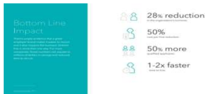
Figure 2 LinkedIn's Survey on Employer Branding

Employer branding can streamline the prolonged recruitment process. A survey by LinkedIn in 2011 found that companies using branding strategies to aid in the recruitment process could hire one to two times faster than before. The survey also discovered a 50% increase in qualified candidates applying within their respective fields. This reduction in administrative work and increased chances of finding the right candidates make the hiring process smoother and more efficient.