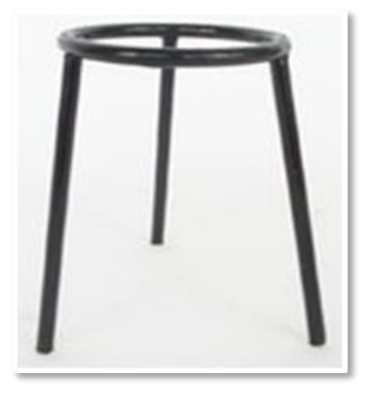
Fig 5. Three-legged Furnace means the same as Three-twisted Rope

The fourth identity. The three-twisted steering wheel or the original word tali bapilin tigo means the three pillars that are the reference for solving the problems of the Malay people of Riau, namely custom, government, and religion. Where these three pillars cannot be separated and become a unity with others, the three pillars are spoken in one breath, "adat bersendikan sara', sara' bersendikan kitabullah" which means, the applicable customs will be in line with the government and then both of these are guided to run according to religious law, namely the guidance of the Book of Allah, the Qur'an. If a problem occurs, it will be resolved according to the three pillar laws, if a problem cannot be resolved using customary law, it will be resolved by government law, but if it cannot be resolved using government law, it will be resolved by religious law.