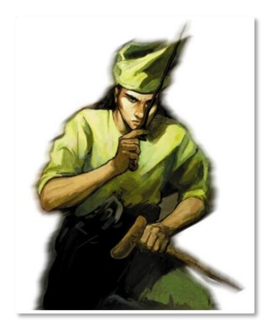
Fig 3. The golden yellow color of Riau traditional clothes Pinterest) (Source: Pinterest)