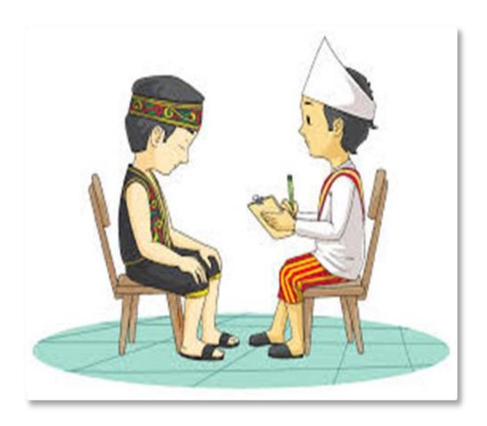
Fig. 6. Illustration of Traditional Leaders Sitting in Deliberation

The three-legged stove is also called and has the same meaning as the Three-Legged Rope. The philosophy is, if the cauldron is placed on a furnace that only has one or two legs, the position will be lame and the food in the cauldron will spill. However, if the stove has three legs, the position will be balanced and the cauldron will not fall and the food will cook perfectly. Likewise, in the process of problem solving, if a problem occurs but these three pillars are not presented sitting together, then solving the problem will not find a bright spot and there will be imbalances in understanding.