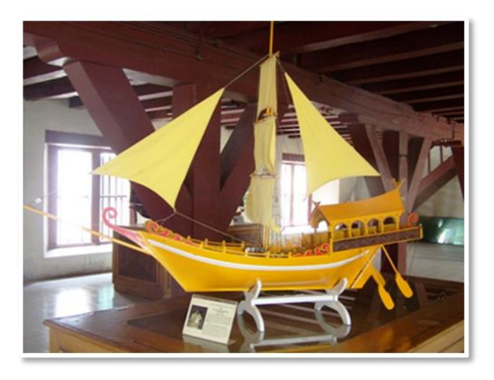
Fig 2. Lancang Kuning Ship

Second identity. Golden yellow is the national color of the Riau people, symbolizing greatness, authority and splendor. The golden yellow color could only be used by the king and his descendants in the past. During the Kingdom, yellow was a prohibited color that could not be used carelessly, so golden yellow was taboo for ordinary people to wear. This explains that the golden color is the national color of the Riau people and Riau was once a royal land.