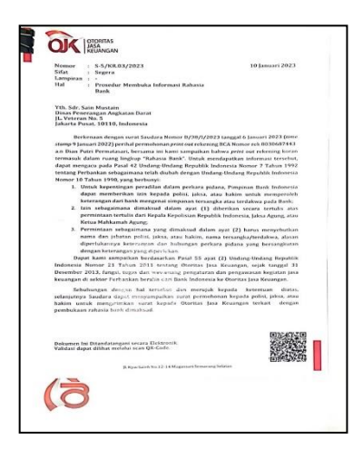
BCA Bank Letter and Letter from the Financial Services Authority (OJK) regarding the rejection of requests for evidence