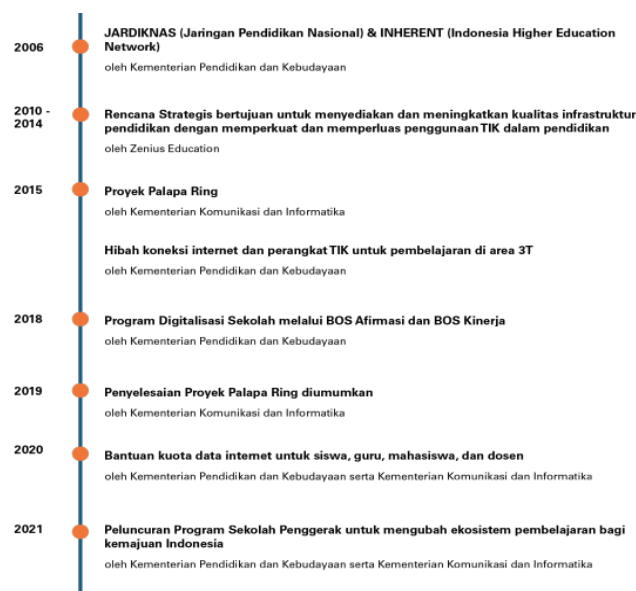
Figure 2. Timeline of digital education initiatives - Internet, infrastructure and devices (UNICEF Indonesia, 2021)

Several factors contribute to the low level of digital-based learning media utilization in online learning processes in border areas. Firstly, the uneven development of technology-based infrastructure in border regions results in schools and areas lacking internet access, thus hindering online learning activities. Secondly, the absence of free internet access in border areas affects the availability of internet data for teachers and students during online learning activities. The community requires free internet services due to the low economic capacity of border region residents, making it difficult to meet the demands of online learning activities. The majority of individuals in these areas work as farmers, with low per capita income. Thirdly, teachers' limited knowledge in managing online learning activities, including the use of digital-based learning media, contributes to the issue. Teachers must comprehend the benefits of learning media and incorporate them into both online and offline learning processes.