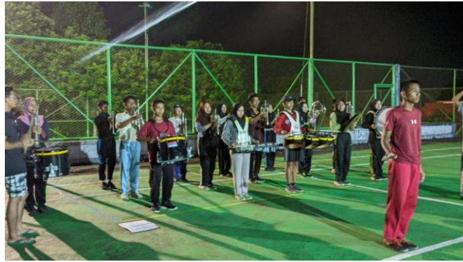
Figure 3: The training process using the drill/exercise method