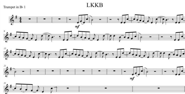
Figure 4: LKKB Beam Notches

The song played in this competition is the song Bangun Pemuda Pemudi. This race is followed by male players with a distance of 8 km, girls 6 km and mixed 8 km. This type of competition is playing a drumband instrument while walking a long way from the start to the finish which is kilo meters away.