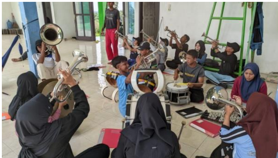
Figure 2: The trainer demonstrates how to play the drumband instrument.

The demonstration method is often referred to as the method by imitation. This method focuses more on the trainer. The coach has an important role in delivering the material by modeling or demonstrating movements or how to play drumband musical instruments and marching movements contained in the drumband.