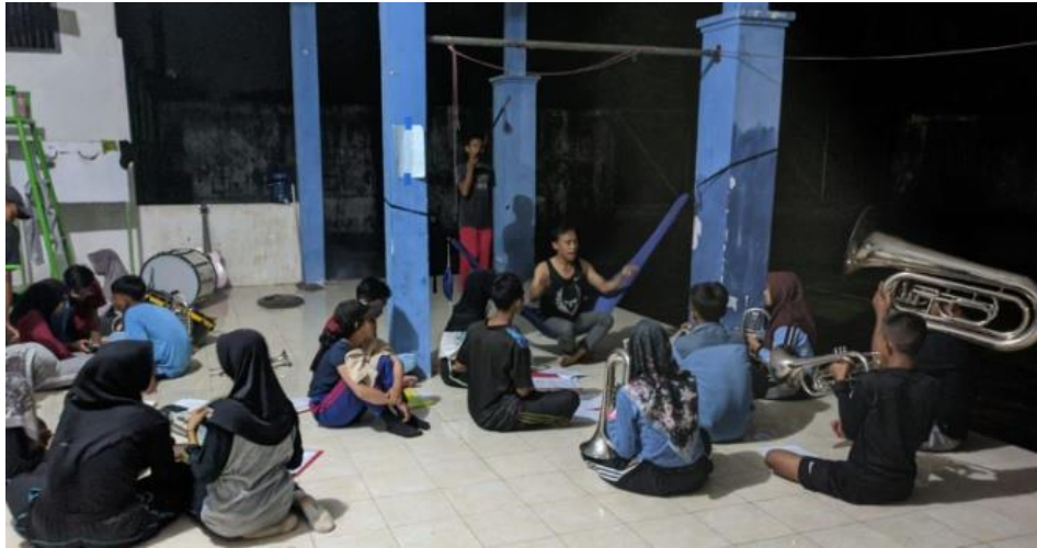
Figure 1. The trainer explains the material using the lecture method

will be followed and the song material to be played. In using the lecture method, players must pay attention to the direction of the coach and apply it.