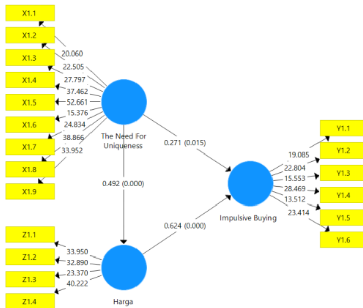
Figure 3. Results of Bootstrapping Test on SmartPLS

The first hypothesis (H1) in this study states "It is suspected that The Need For Uniqueness has a positive and significant influence on online prices". Through hypothesis testing with PLS with test results showing that the coefficient value is 0.492 with a P-value of 0.000. When compared with a significance level of 0.05 (5%) then P value < Significance Level which means significant, so it can be concluded that the first hypothesis can be accepted .