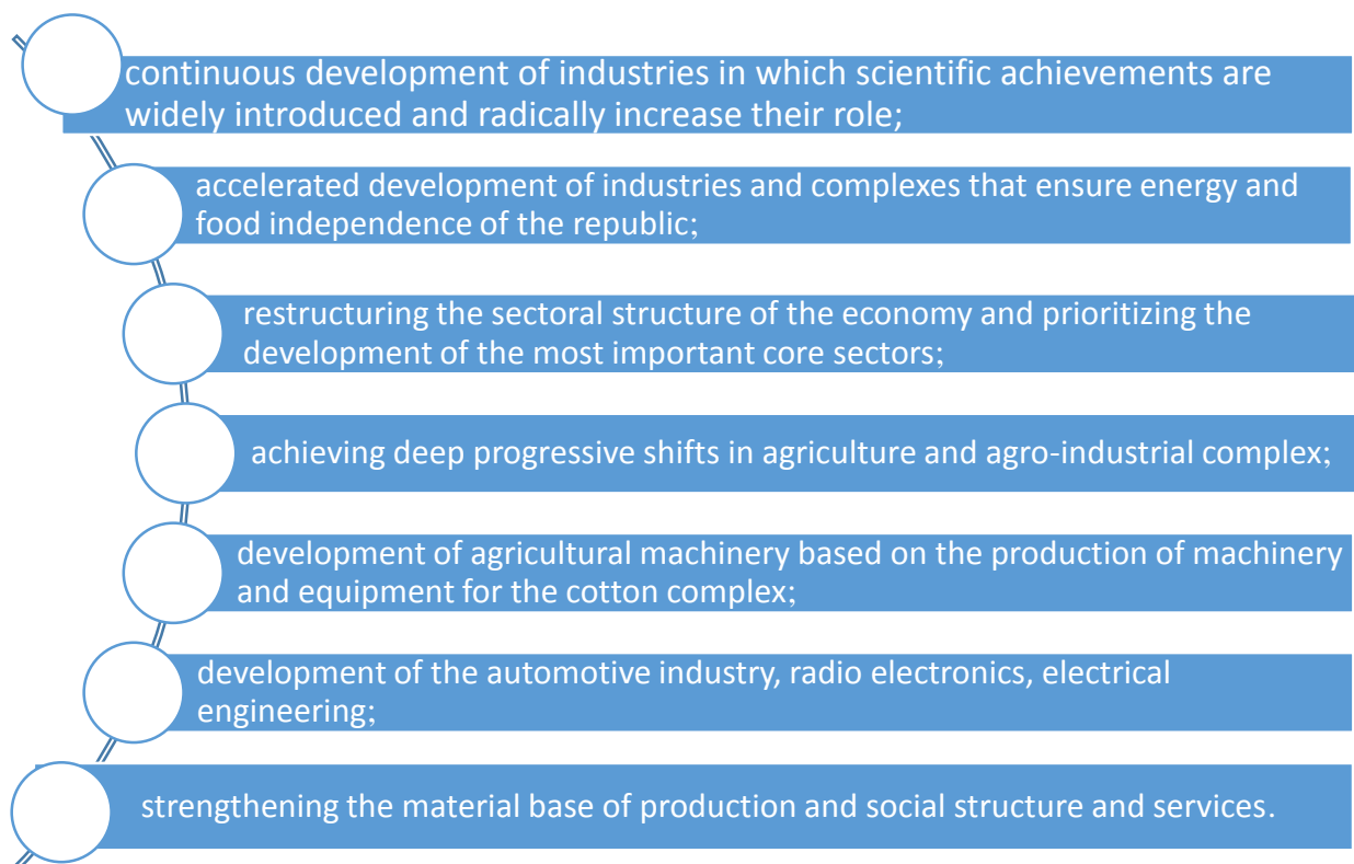
Figure 2. The main directions of structural changes in the implementation of economic reforms in Uzbekistan

The second step in the structural transformation of the country's economy is the enactment of the Law of the Republic of Uzbekistan "On denationalization and privatization", which played an important role in creating a multi-sectoral economy, overcoming the decline in production and stabilizing the financial situation. This is because the structure of production in state-owned enterprises due to economic reforms is associated with structural changes. Structural changes are carried out in different directions, including measures such as the construction of new networks, the expansion of some, the reduction of some ineffective prospects (Figure2).