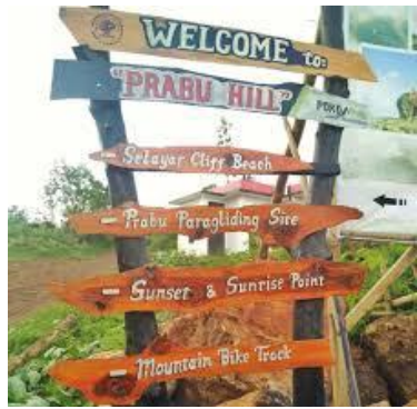
Fig. 3 Information Board of Gunung Prabu Ecotourism Attractions Created by Pokdarwis

Chairman Pokdarwis also explained the initial activity that has been done is the creation of information boards. This information board is placed at the entrance to the area of gunung Prabu to provide an overview of the tourist attractions contained in it. This information board is created independently and self-funding for the contributions of pokdarwis administrators can be seen in Figure 3.