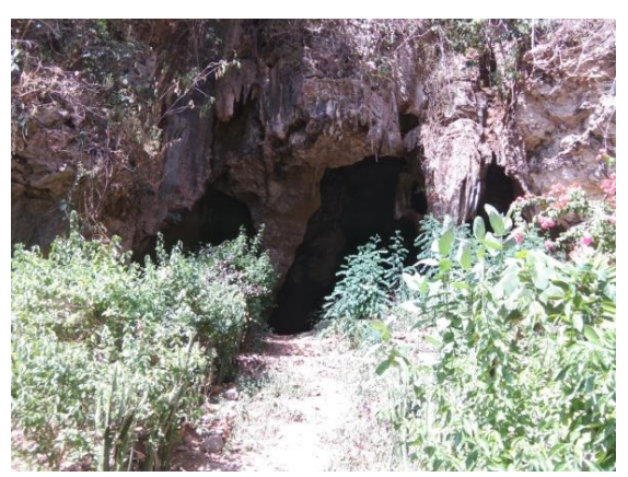
Fig. 5 Ecotourism Area Of Goa Bangkang Gunung Prabu

The manager of goa tourist area will apply the dress code to cover the awrah using local woven cloth for tourists visiting the cave to maintain the sacredness value of the tourist attraction.