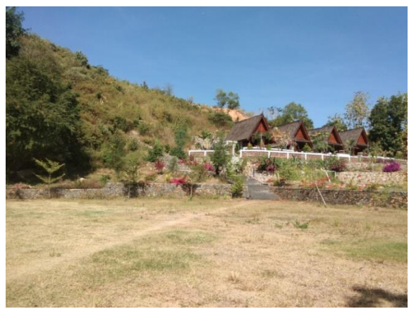
Fig. 6 Potential Camping Ground area in Gunung Prabu Ecotourism Area.

The vast forest and natural areas make the area of Prabu mountain ecotourism destination very potential to be developed into a camp area. The natural panorama of the hills will be a plus for wisatwan to choose to carry out camping ground activities in this area. Experience and explore the forest can be a special attraction for tourists who like camping tours. In addition, springs are available under the hill in the form of small wells ( Mbul ). This campsite service can be combined with hiking activities exploring hills and forest areas and plantations of residents. This activity can also be combined with research and tree planting activities. Prabu mountain ecotourism destination becomes a camp area can be seen in Figure 6.