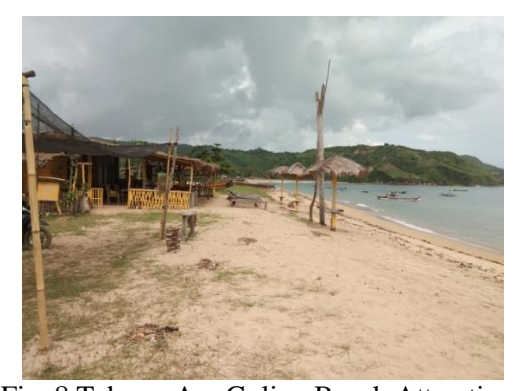
Fig. 8 Tebuaq-Are Guling Beach Attractions

The geographical location of prabu village in the south is directly adjacent to the Indian Ocean making the prabu mountain ecotourism area has several coastal objects such as Selayar beach and Are Guling. Are Guling beach area is one of the beaches that are used by local residents as the location of The Sweep. The location of the sing-down is the location of the beach that is used by residents as a place to carry out the tradition of smelling nyale. Nylae smell tradition is a tradition of catching luat worms that become a cultural tourist attraction. This tradition is carried out annually on the 20th day of the 10th month of sasaq calendar (Informant 04). Are Guling beach attractions can be seen in Figure 8.