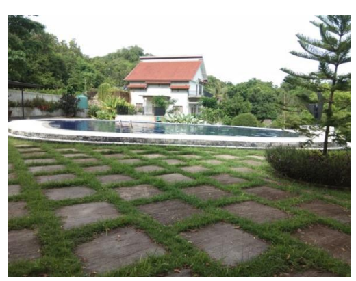
Fig. 7 Utilization of Forest Area to Become Tirta Tourism Attraction

Tourism potential developed by Pokdarwis in prabu mountain area is tirta tourism business. Tirta tourism business in the form of a bathing pool is privately owned by the chairman of Pokadarwis which was built from the profit from the gold mining activities of Mount Prabu. The management of this bathing pool is in collaboration with Pokdarwis. The business of tirta tourism facilities in the prabu mountain area has only started since 2018. Goa Bangkang tourism object first developed, then through pokdarwis initiative this tourist attraction was developed into tirta tourism. The utilization of wsata area into a bathing tour can be seen in Figure 7.