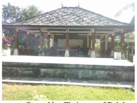
Fig. 9 Halal Restaurant Owned by Chairman of Pokdarwis Prabu Village

This halal restaurant is made from the personal processing of prabu mountain gold mine. The halal restaurant owned by the chairman of Pokdarwis can be seen in figure 9.