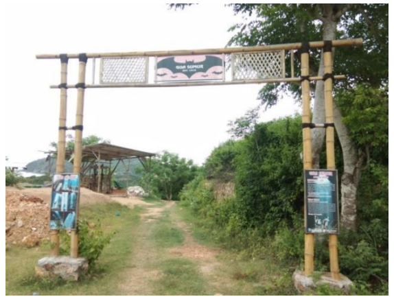
Fig. 4 Entrance to the attraction Goa Sumur Gunung Prabu

One form of tourist attraction established by the tour conscious group prabu village can be seen in Figure 4.