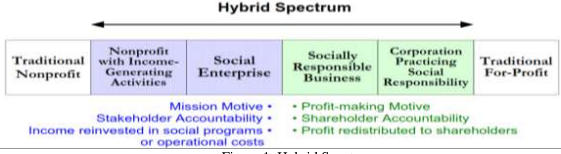
Figure 1. Hybrid Spectrum (Source: Alter, 2007)

Meanwhile, Yang et al. (2014) compare social enterprises and commercial companies (for profit) based on mission and values. Commercial companies are focused on maximizing profit; therefore these companies are market driven. On the other hand, social enterprises pursue social missions simultaneously. The operational goal of these social enterprises is to maximize socially oriented profit. Hence, the social enterprises devote all of their resources to create social impact and value. By using a hybrid spectrum, Alter (2007) discusses the differences between social enterprises and commercial enterprises (for profit). On the right spectrum, there are for-profit entities that create social value; yet, its main motivation is related to profit creation and distribution to the stockholders. Meanwhile, on the left of the spectrum, there are non-profit organizations whose commercial activities generate economic value that is diverted to finance social programs. Yet, their main motivation is the mission achievement, as determined by the stakeholders mandate. Alter, (2007) presents a hybrid spectrum of social enterprises and commercial enterprises as in Figure 1 below: